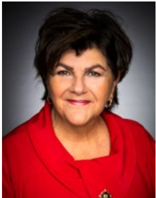
Honourable Tim Houston, M.L.A. Premier of Nova Scotia

Lights, camera, action! Film and TV can help us learn about each other, tell amazing stories and, of course, entertain us and get folks to come and visit! Atlantic Canada is full of compelling stories, interesting characters and talented creators looking to share them with the world. The Atlantic International Film Festival is an annual celebration of the people who make this place, our home. Your federal government, through the Atlantic Canada Opportunities Agency, is a proud supporter of the AIFF and the folks who make it an event that cannot be missed every year. So, as you sit back and relax at the theatre, take a moment to recognize the hard work and dedication of the producers, actors, directors, and countless other people who make the magic happen behind the scenes. Enjoy the show!